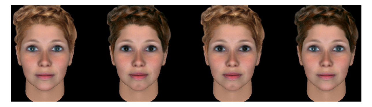
Figure 2. An example of a quartet used in Study 2. A Delphi-based computer program was used to present the virtual women's faces. For a given rater, four faces of the same virtual woman were selected, depending on the rater's own traits (initially recorded in the computer program by the observer; see table 1). These four faces corresponded to the four cases of preferences: homogamy (the face displayed similar character states as the rater), heterogamy (the face displayed opposite character states), recessivity (the face displayed recessive character states) and dominant (the face displayed dominant character states). The rater was instructed to click on the woman that he would prefer to build a family with. Images are from virtual subjects.